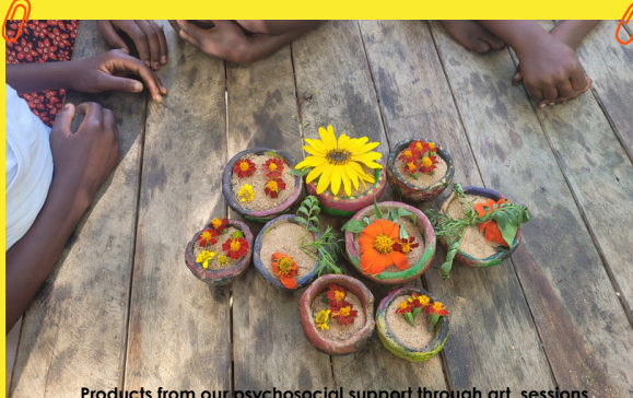
Products from our psychosocial support through art sessions

If you would like to contribute to our work you can contact us on admin@mukundizw.org or +263713437688