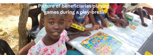
Picture of beneficiaries playing games during a play-break

It is our mission to, create environments where orphans not only access their immediate needs but also develop the necessary skills and mindsets to navigate real-world complexities with confidence as they transition into adulthood. We are therefore excited that twenty of our beneficiaries have now started identifying our area of operation as a safe space. The project is acting as a catalyst in creating positive outcomes in the community we work in. This is because our beneficiaries have developed skills and knowledge in reading and writing; first aid; and information technology. Since the project is being carried out in a rural community where opportunities are often limited, a larger population of the adult members of the community have had limited opportunity to explore any of the aforementioned areas. Our beneficiaries, on the other hand, have gained skills and knowledge in all these areas, so when they share their knowledge at home with their guardians/parents and the community, they are being listened to. This is happening in a community where young people are not often listened to. We believe that, this means in the future, our beneficiaries and other young people will come up with innovative solutions to problems faced in the community, and these will be welcomed. The program's benefits are visible and tangible to the community therefore, it has created room for collaboration and support.