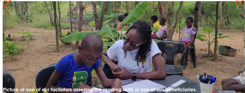
Picture of one of our facilitators assessing the reading skills of one of our beneficiaries.

While some of our beneficiaries are still mastering sound-letter relationships, awareness, and word building, others have moved to a stage where they are building on their vocabulary and comprehension skills through reading books. Our overall goal with this camp is that our beneficiaries will have improved communication, comprehension, and presentation skills.