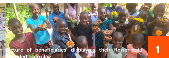
Picture of beneficiaries displaying their flower-pots made from clay