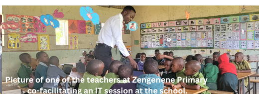
Picture of one of the teachers at Zengenene Primary co-facilitating an IT session at the school