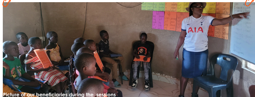
Picture of our beneficiaries during the sessions