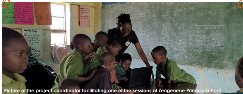
Picture of the project coordinator facilitating one of the sessions at Zengenene Primary School